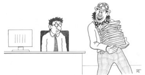
'Cheer up. These forecasts will make you laugh!'

We are quite prepared to accept that we are wrong and markets are much cheaper than we believe. However, we believe the current bull arguments seem to rest more on aphorisms and clichés than anything concrete.